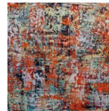
KHALILAH BIRDSONG The Infinite Abyss , 2018 Acrylic on Canvas, 76 x 76 cm (30x30 in)