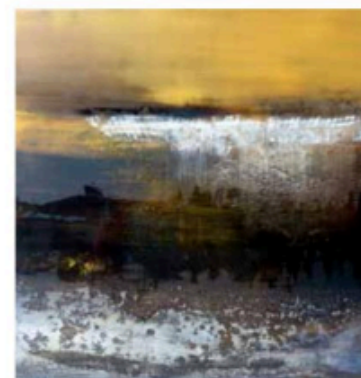
CAROLE KOHLER Stonewashed , 2018 Mixed Media on Canvas, 80 x 80 cm (31x31 in)