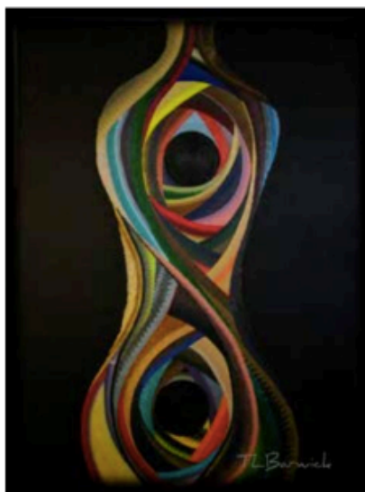
TRACY L. BARWICK She Flows , 2018 Toho and Miyuki Japanese Glass Beads 76 x 101cm (30x40 in)